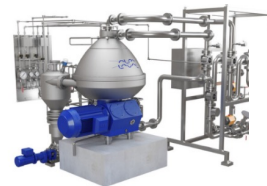
High speed separators