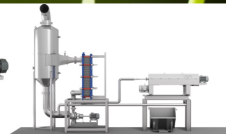
Evaporation systems and ZLD