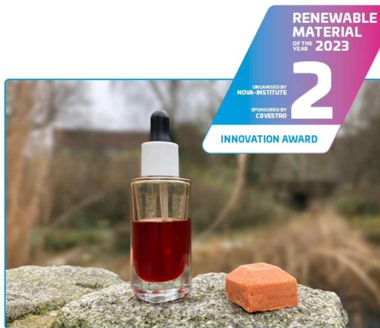
Carbon-Light Yeast Oil COLIPI (DE)