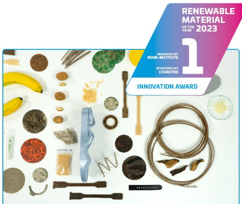
KUORI – Bio-based and Biodegradable Elastic Materials KUORI (CH)