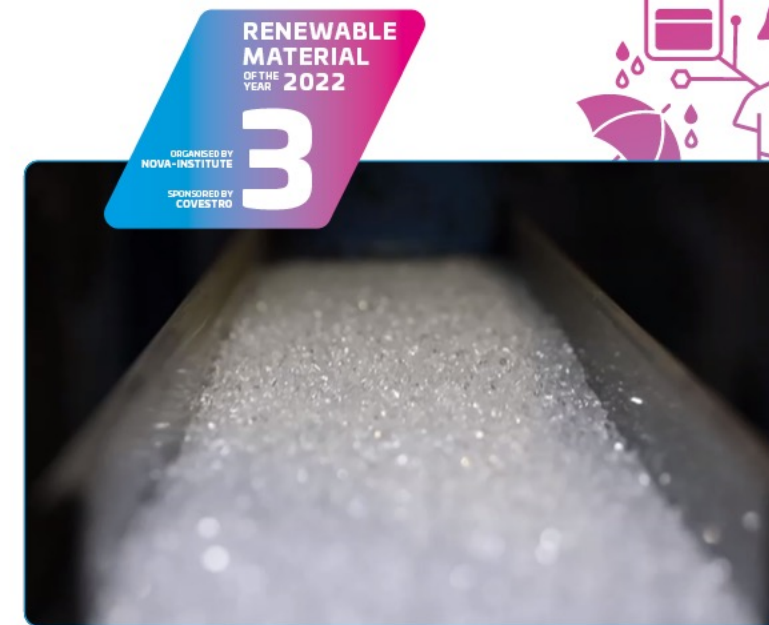
Eastman (US) Material-to-Material Molecular Recycling Technologies