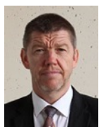
Gudbrand Rødsrud Borregaard AS (NO)