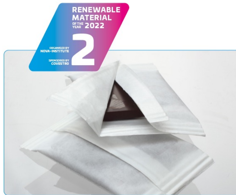
Lactips (FR) Plastic Free Paper™ with CareTips® – a Natural Polymer to Rethink Plastic