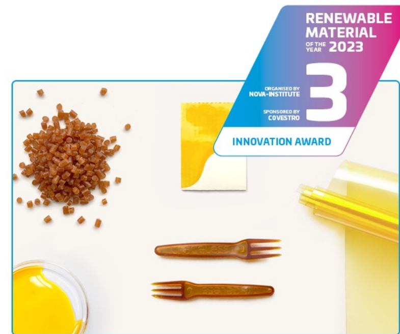
traceless® – Plastic-Free Natural Polymer traceless materials (DE)